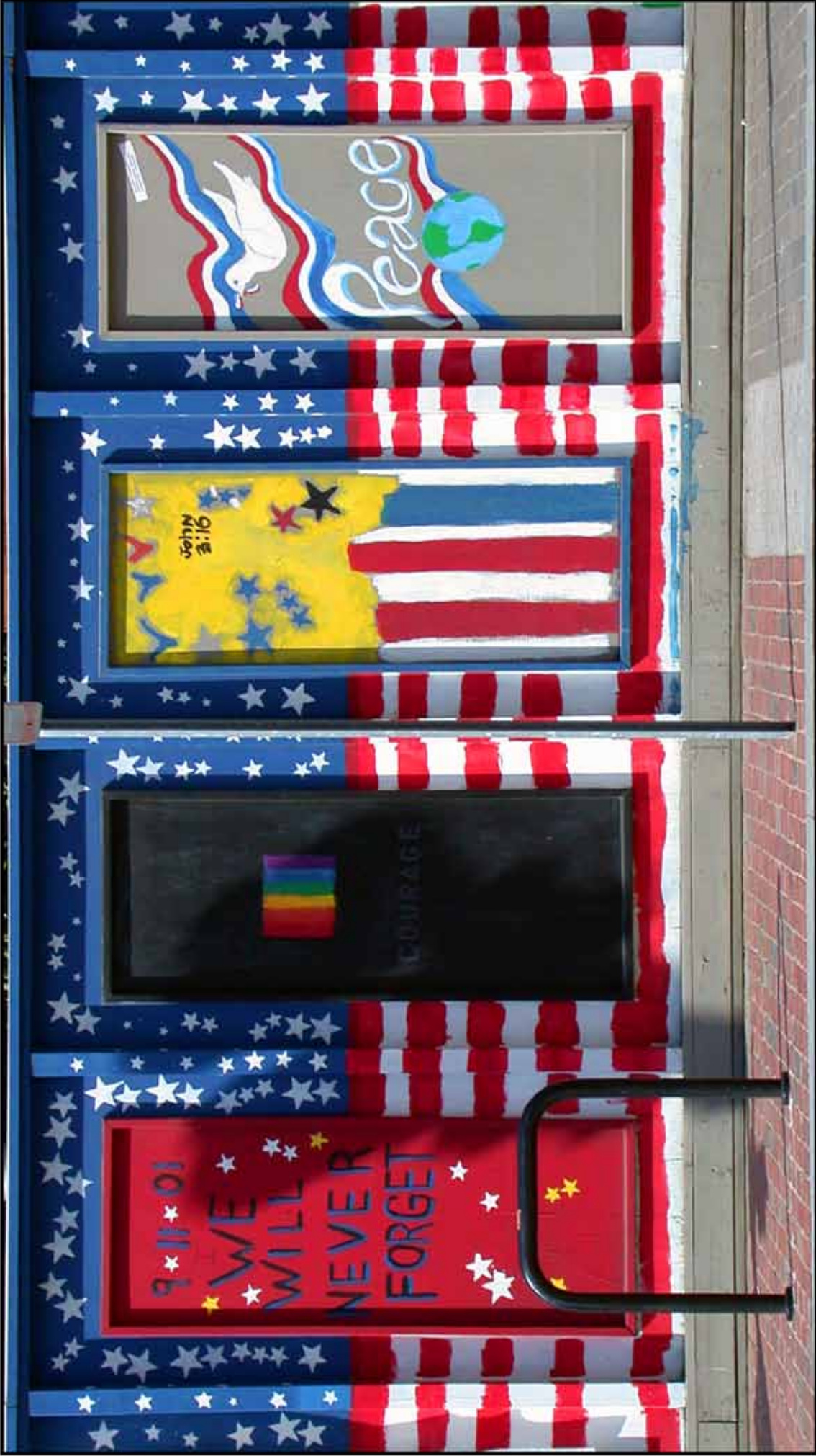
We will Never Forget - Washington, DC, USA, April 2003